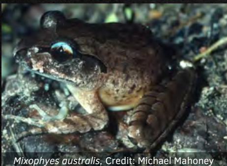
Mixophyes australis , Credit: Michael Mahoney

Want to read more about Mixophyes australis ? https://mapress.com/zt/article/view/zootaxa.5297.3.1