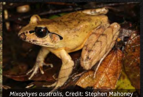
Mixophyes australis