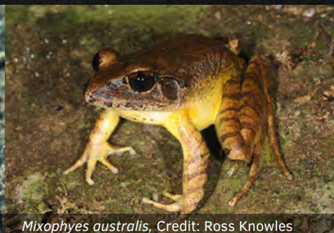
Mixophyes australis